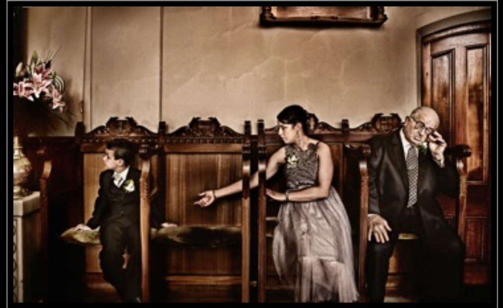
Gold AIPP 2009