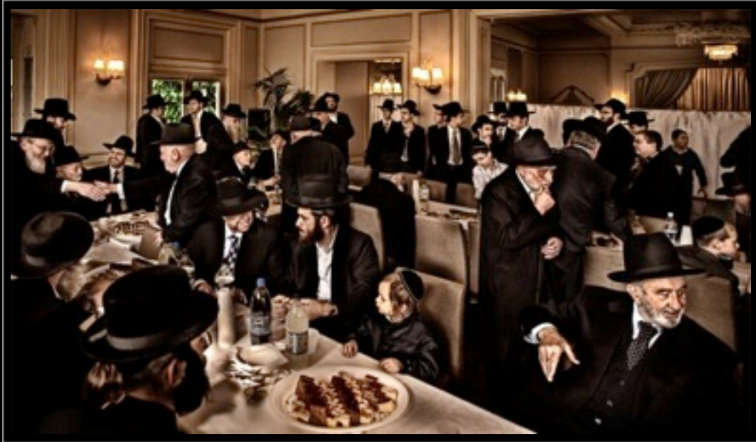
Gold-Distinction AIPP 2009